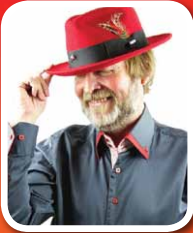
Tony Robinson OBE www.TonyRobinsonOBE.com